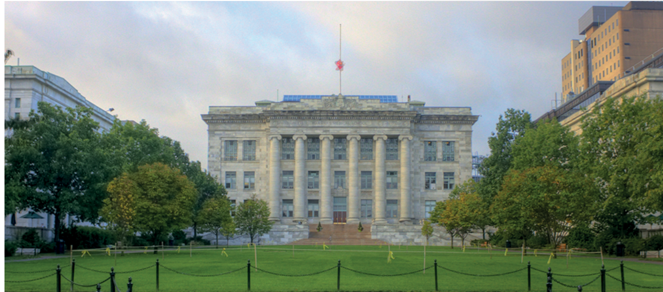
RISE Egypt Launch Event on Harvard Longwood Medical Campus